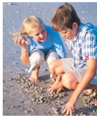
Sunny delights: (from far left) A putt-putt game at the Hawaiian Rumble; family fun on the Grand Strand; the Live Oak Allee at Brookgreen Gardens.