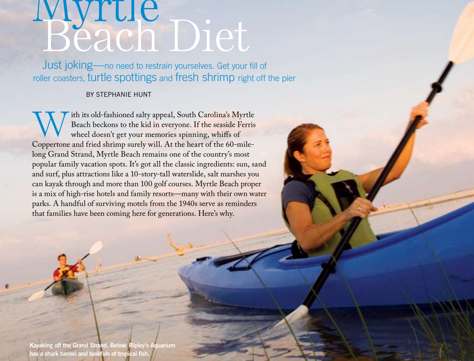
Kayaking off the Grand Strand. Below: Ripley's Aquarium has a shark tunnel and tankfuls of tropical fish.

With its old-fashioned salty appeal, South Carolina's Myrtle Beach beckons to the kid in everyone. If the seaside Ferris wheel doesn't get your memories spinning, whiffs of Coppertone and fried shrimp surely will. At the heart of the 60-mile-long Grand Strand, Myrtle Beach remains one of the country's most popular family vacation spots. It's got all the classic ingredients: sun, sand and surf, plus attractions like a 10-story-tall waterslide, salt marshes you can kayak through and more than 100 golf courses. Myrtle Beach proper is a mix of high-rise hotels and family resorts—many with their own water parks. A handful of surviving motels from the 1940s serve as reminders that families have been coming here for generations. Here's why.